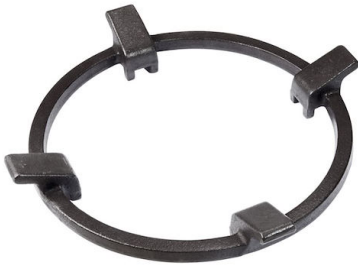
Cast iron wok support 9601 727